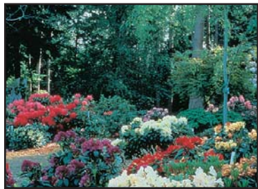
Flowers abound in the Cascade Circle region of Washington State.

BELLINGHAM. Take I-5 north to this Northwest port city steeped in maritime heritage. The southern terminus of the Alaska Ferry and the gateway to Canada, it's rich in history, with fine shops and art galleries. Take a cruise to the nearby San Juan Islands or go whale-watching off Orcas Island. Information: (888) 373-8522. www.bellingham.org