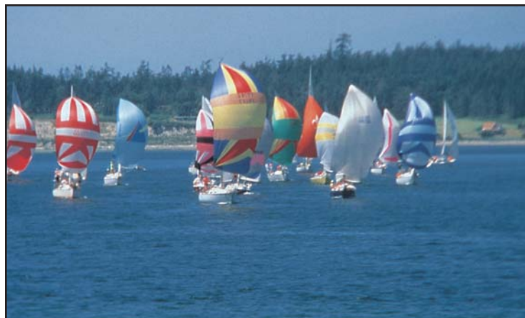
Sailors enjoy a beautiful day in Oak Harbor.

After you've soaked up the ambiance at Oak Harbor, head back or catch a ferry in Clinton for a 25-minute sail back into the Seattle area.