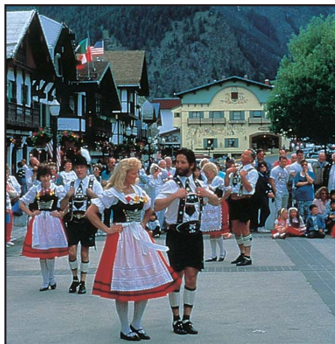
Bavarian Festival in Leavenworth.