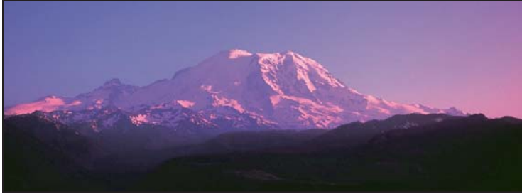
Mount Rainier National Park at sunset.

MOUNT RAINIER NATIONAL PARK. Near the junction of Hwys 123 and 12, the Ohanapecosh Visitor Center is the perfect introduction to this area. It features exhibits on forest ecology and the history of the park. From Hwy 123, drive west on S.R. 706 to see views of towering Mount Rainier , a 14,411-foot ice-clad volcano. Information June through September: (360) 569-2211.