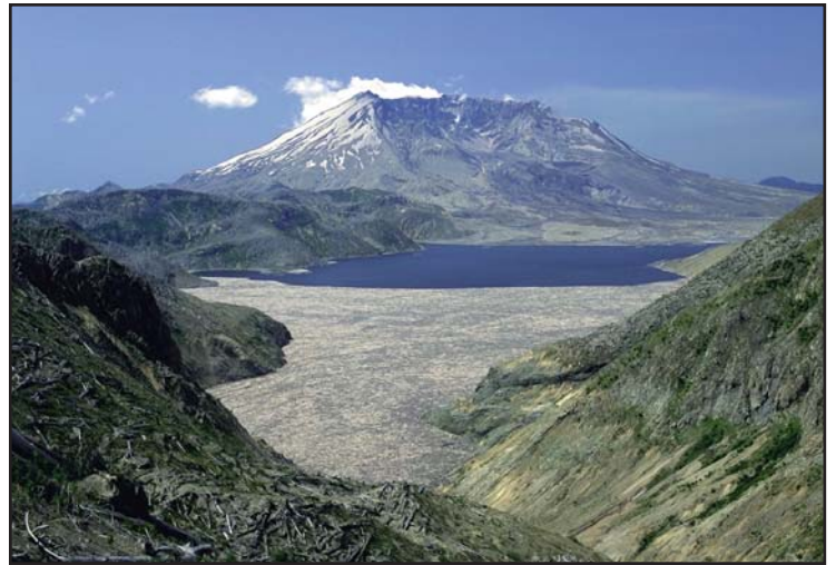
Mount St. Helens.

BATTLE GROUND. Battle Ground is a small, but fast growing city surrounded by country landscapes. Recreation attractions are Battle Ground Lake State Park, The Lewis River (North and East Forks), Lewisville Park, the Skate Park at Fairgrounds Park and other lakes, streams, and forest recreation areas. You can go from mountain top to ocean beach within a day's drive! Ski, fish, wind-surf, hike, hunt, go boating, golf, go horseback riding, swim, sight-see, or attend major professional sporting events. Chamber of Commerce: (360) 687-1510.