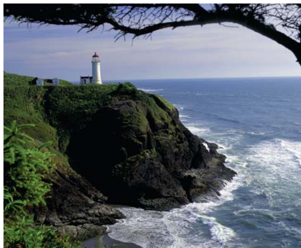
A lighthouse stands watch over rugged shorelines.

Your loop tour is almost completed – return to Aberdeen and then take U.S. 12 east to Hwy 8 and back into Olympia.