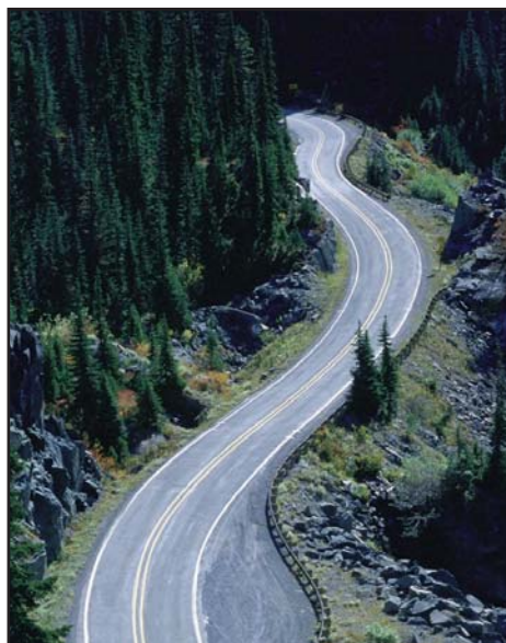
Winding scenic roads through the towering trees and mountains.