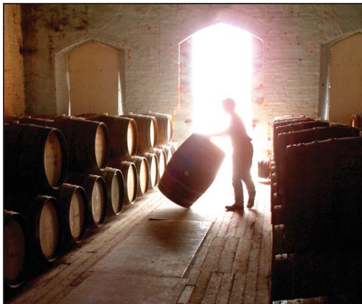
Tour one of the many wineries of Washington state.

From peaceful lakes and roaring falls to wild rides through steep river canyons, this region offers adventure with every mile. Take a break from the action with some fascinating museum tours and learn all about pioneer life. Try to catch a six-pound bass in the morning and see a laser light show on the side of a dam at night. Tour a winery or ride on a gondola. It's all waiting for you right around the bend.