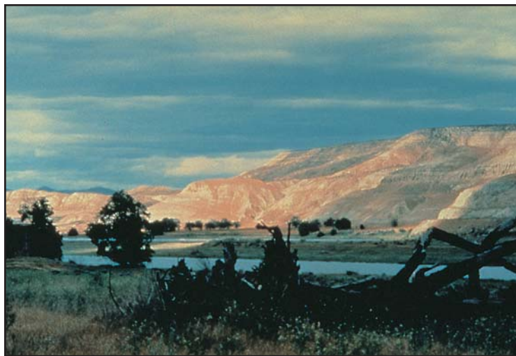
The Tri-Cities area offers some of the world's most spectacular views.

PULLMAN. Home to Washington State University , founded in 1890. The Anthropology Museum on campus is renowned for their collection of Pacific Northwest Indian culture. You'll need a campus permit for a tour. Chamber of Commerce: (800) 365-6948.