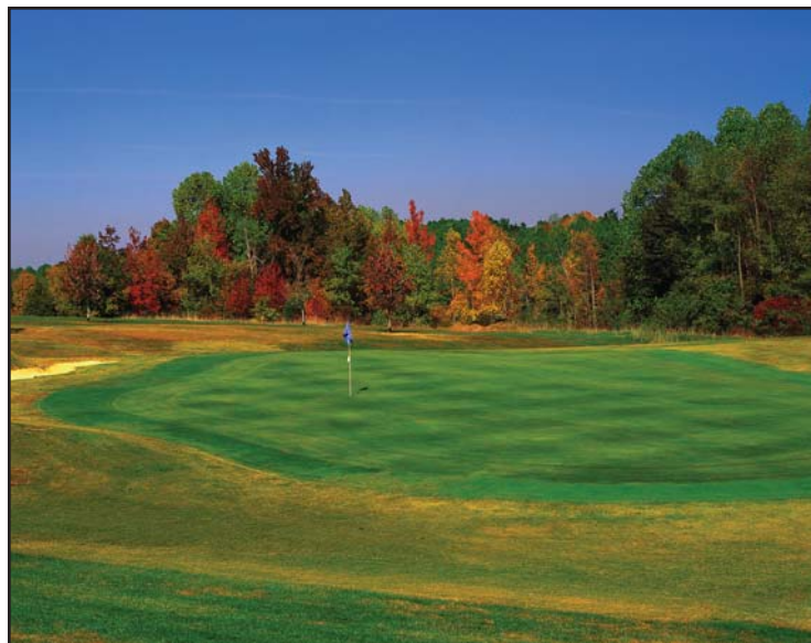
Enjoy a beautiful day of golf.