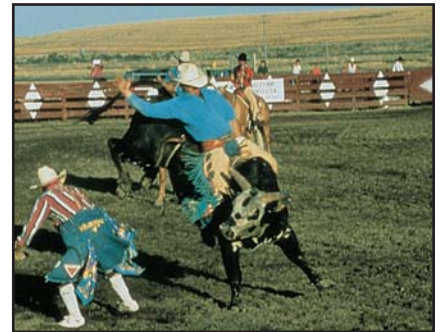
Enjoy the experience of a rodeo in Ritzville.

RITZVILLE. Return to Moses Lake and continue east on I-90 into this small farm community. Visit Carnegie Library , the Dr. Frank R. Burroughs Museum , the Burlington Northern Railroad Depot , and the N.H. Greene Mansion . Chamber of Commerce: (509) 659-1936. 20 miles to the east is Sprague Lake , a great fishing spot in the middle of a basalt lava flow.